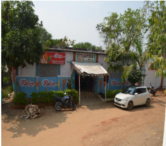
1. Narayan Canteen