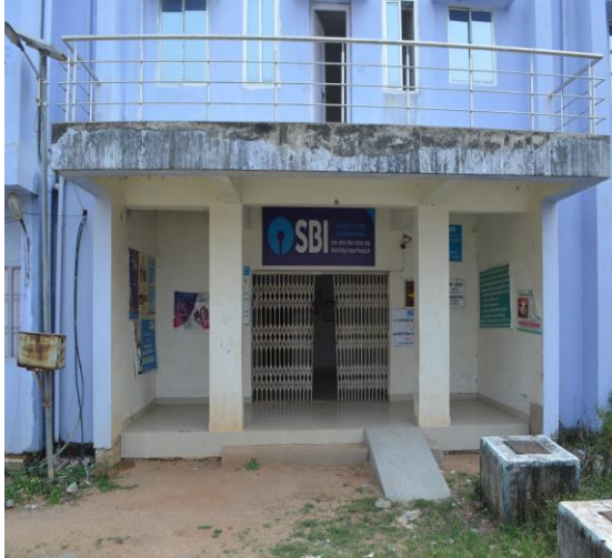
STATE BANK OF INDIA –CAMPUS BRANCH