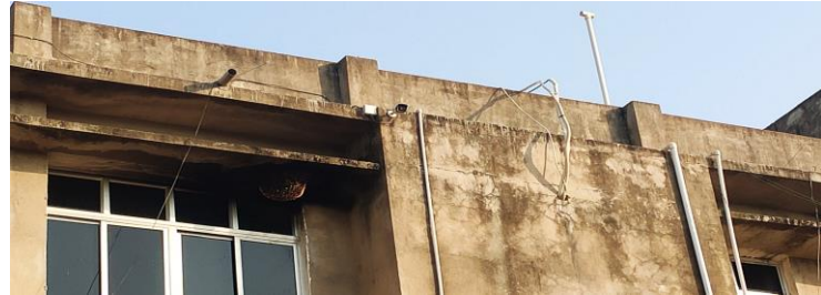
24 hrs – CC CAMERA SURVEILLANCE