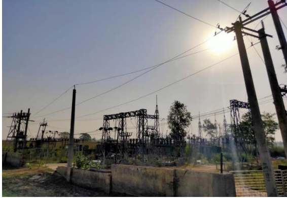
POWER GRID-CONNECTIVE CAMPUS