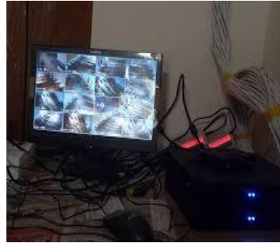
CC CAMERA MONITORING