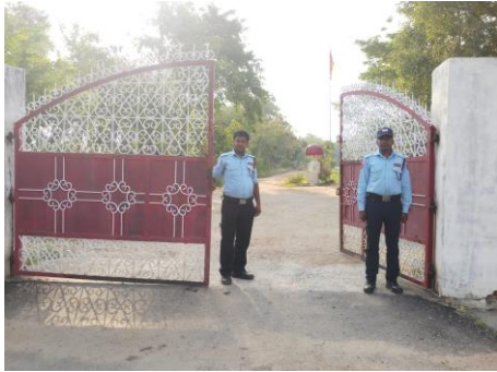
SIS SECURITY ZONE – MAIN GATE