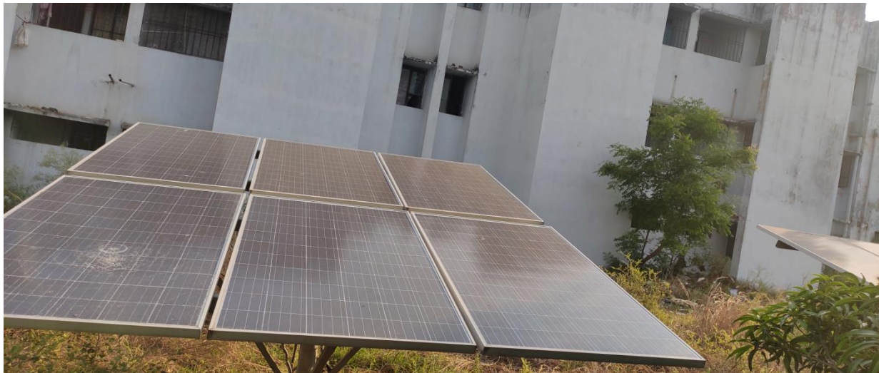
SOLAR SYSTEM INITIALIZATION