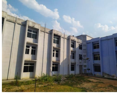
Girls Hostels Blocks