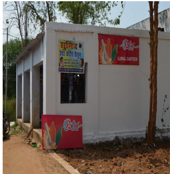
HAIR CUTTING SALOON