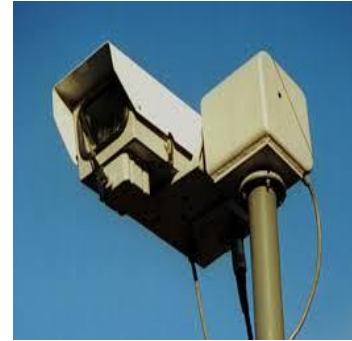
ROAD WAY CAMERAS