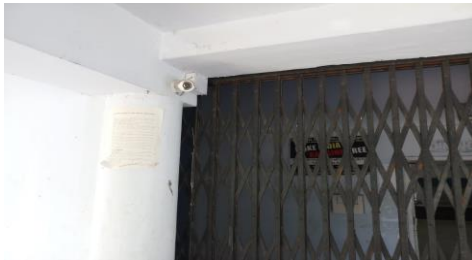
Girls Hostels – Door lock system